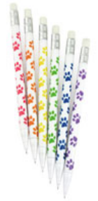
PAW PRINT MECHANICALS