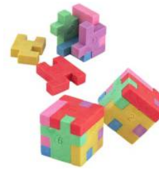
PUZZLE CUBE ERASER