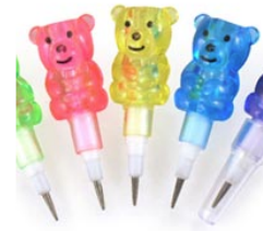
STACKABLE GUMMY BEAR PENCILS