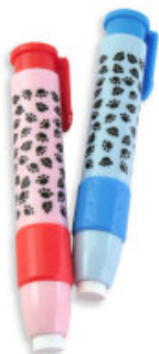
PAW CLICK ERASER