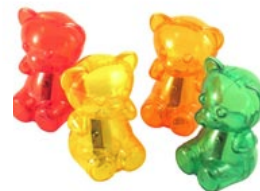
GUMMY BEAR PENCIL SHARPENER